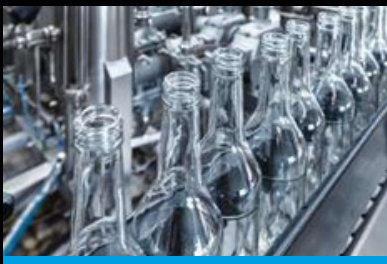
Food & beverage industry