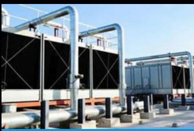
Refrigeration & air conditioning