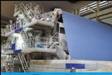
Pulp & paper