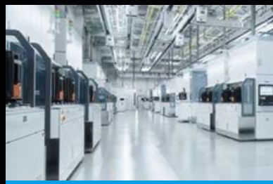
Semiconductor & photovoltaic