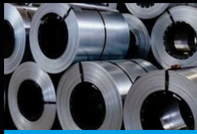
Steel & iron